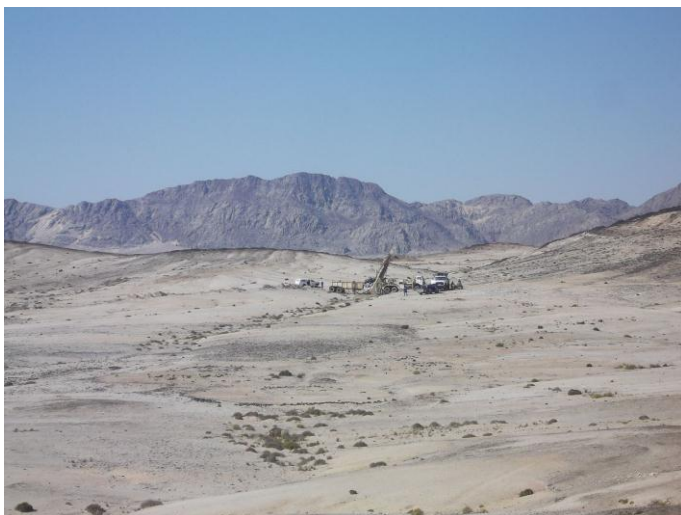
Drilling on a near mine target, a gossan to the north of the mine