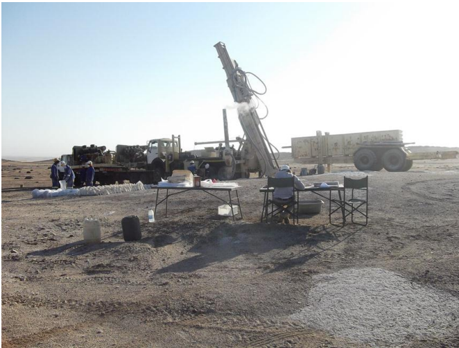
RC drill and logging of samples