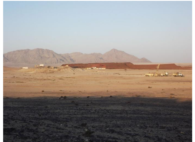
Drilling a deep hole with the oil tailings dump in the background